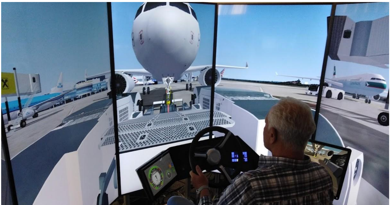
Trepel simulator facility for tug drivers AETP training

Linkedin : www.linkedin.com/company/ecotug/